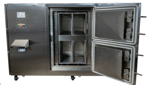
Upright Front Load