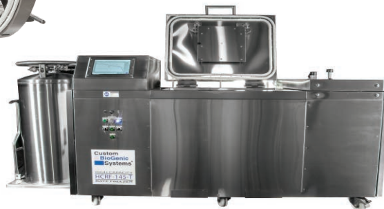
Chest Top Load