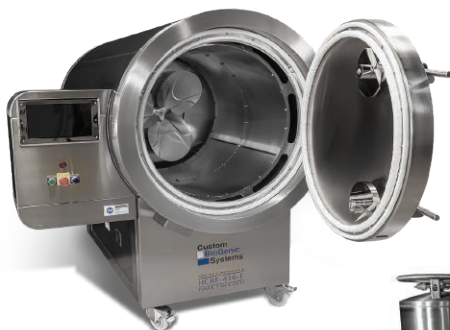
Cylinder Front Load

High Capacity Rate Freezers are available in 3 different models to meet the variety of needs in pharma and research labs.