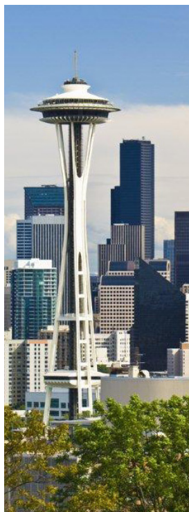
THE SPACE NEEDLE; 605 FEET, BUILT FOR THE 1962 WORLD'S FAIR