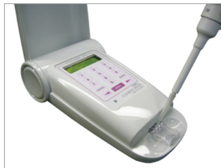
EndoSafe®-PTS™ Rapid Endotoxin Detection System from Charles River Laboratories

BioLife's experiences with bringing testing in-house have been positive; however, in some cases we have decided to continue with contract testing due mostly to an unfavorable return on the investment in the equipment and ancillary support required for the testing. An important aspect of making the determination to bring testing in-house is to include representatives from all affected departments on the return-on-investment analysis team. Having a dynamic team will ensure that testing and quality requirements are met, and that all user requirements have been considered.