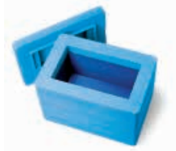
BioT™ ULT LN2 Transporter < -150°C Liquid Nitrogen