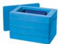
BioT™ ULT Transporter < -70°C to -50°C Dry Ice Based

A breakthrough portable solution for handling and transporting valuable temperature-sensitive frozen biosamples.