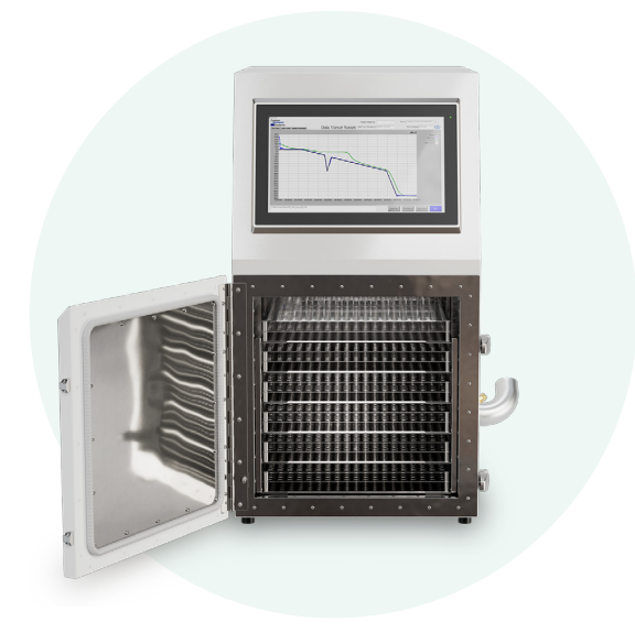
INTERIOR VIEW 67-liter (2.35 cu. ft.) volume inside the chamber